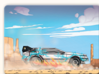
Time Travel Car