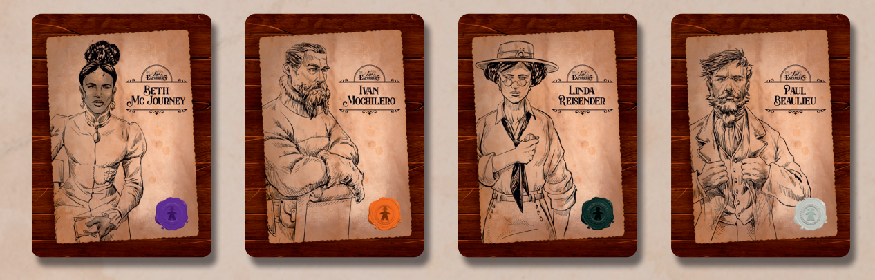
Will you play the brave Beth Mc Journey, the reckless Ivan Mochilero, the intrepid Lynda Reisender or the determined Paul Beaulieu?